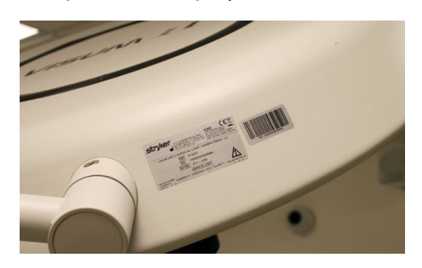
Asset Identification Labels

frustrations and health risks. Metalphoto is used for permanent medical/surgical device and procedure identification applications such as asset identification/UDI barcode labels, procedure identification/communication signs, sterilization container labels & systems, surgical device control panels and several others.