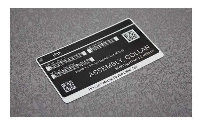
Images on Metalphoto are high-resolution, and legible, even after sterilization.

The Association for the Advancement of Medical Instrumentation (AAMI) published ST79 – the comprehensive guide to steam sterilization and sterility assurance in health care facilities in 2012. ST79 consolidates five AAMI steam sterilization standards into a single comprehensive guideline for all steam sterilization activities in healthcare facilities. The FDA requires all medical devices that must be sterilized to be validated to ST79 – Metalphoto now joins the list of materials tested to ST79 sterilization.