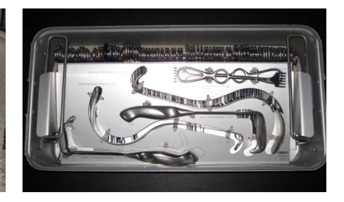
Sterilization Container Systems

Metalphoto® signage memorializes procedures and stays readable after cleaning, sterilization and other abuse.