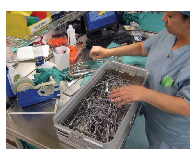
Illegible labels on medical devices can lead to inefficiencies and safety hazards.

Healthcare providers label and identify property and processes in order to keep track of inventory, communicate hospital procedures and manage recalls. Items that must undergo sterilization or other cleaning procedures are especially difficult to label. The sterilization process can degrade plastic or printed materials, rendering these labels and signs illegible. The cost of illegible labels is greater for medical devices and sterilization containers, where the inability to survive the sterilization process can lead to lost inventory and medical errors.